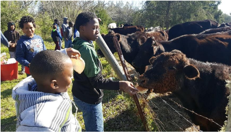
I took a group of elementary students to a livestock farm in Mississippi as a class economic activity.