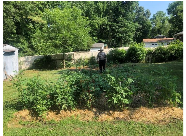
In this photo (June 2022), I am monitoring my garden of tomato, corn, cucumber, and watermelon.